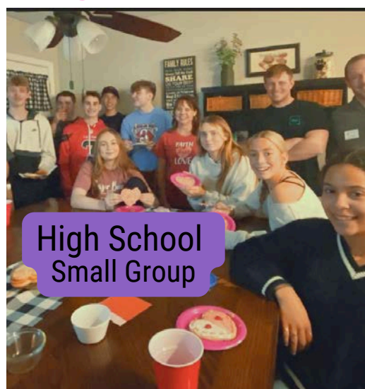
High School Small Group