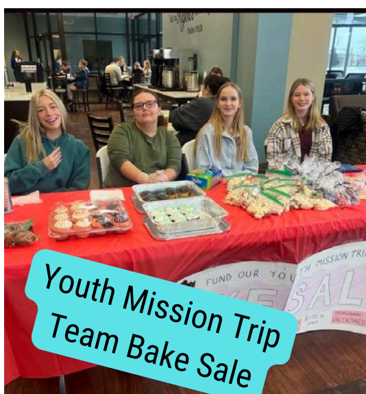
Youth Mission Trip Team Bake Sale