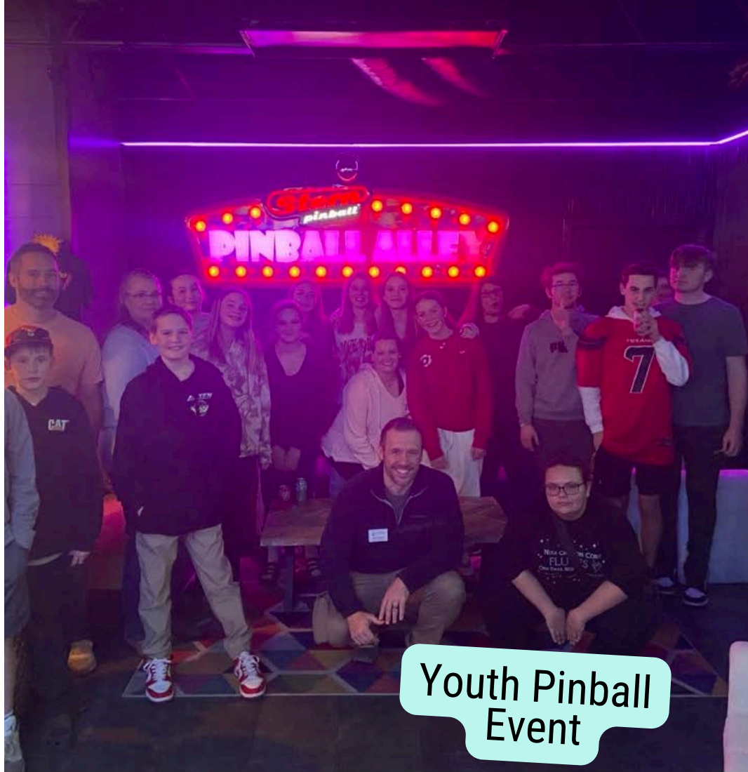
Youth Pinball Event