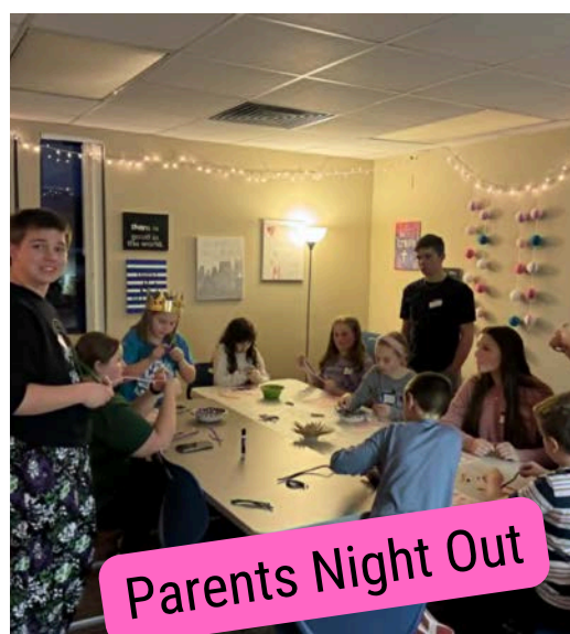
Parents Night Out