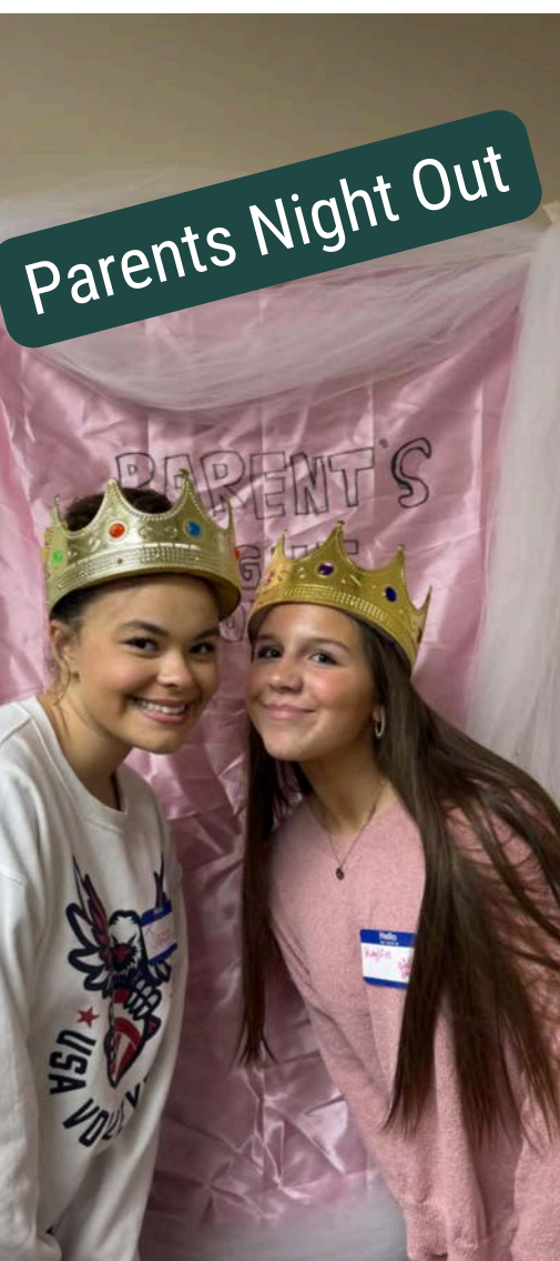
Parents Night Out