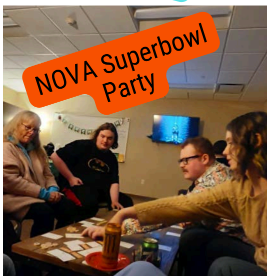
NOVA Superbowl Party